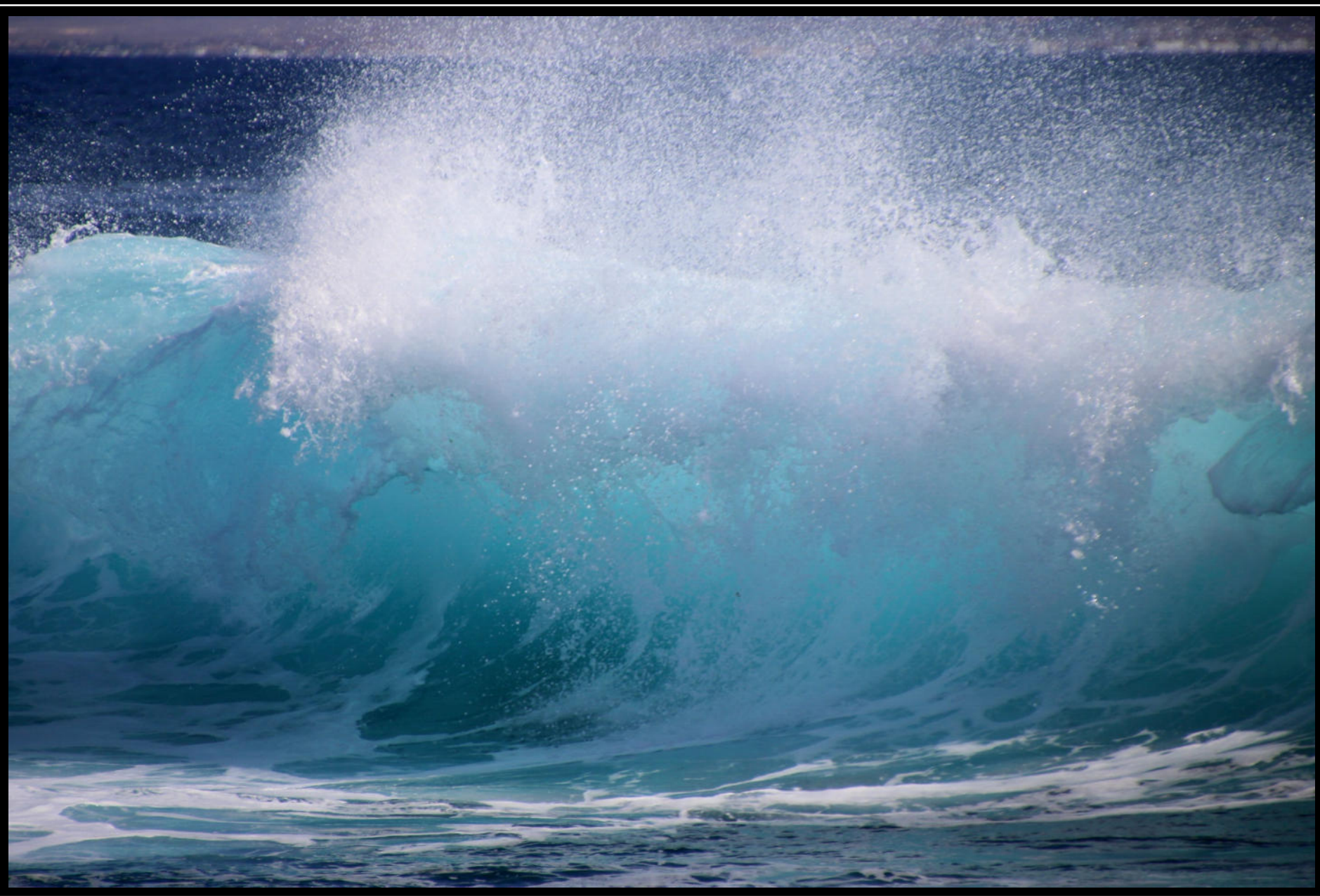
☺ Lose your control once a while to allow the elemental forces of your being to break out. ☺ The lighthouse of Playa Blanca is located at the southern tip of Lanzarote, where one can watch the play of the waves for hours - May 2016