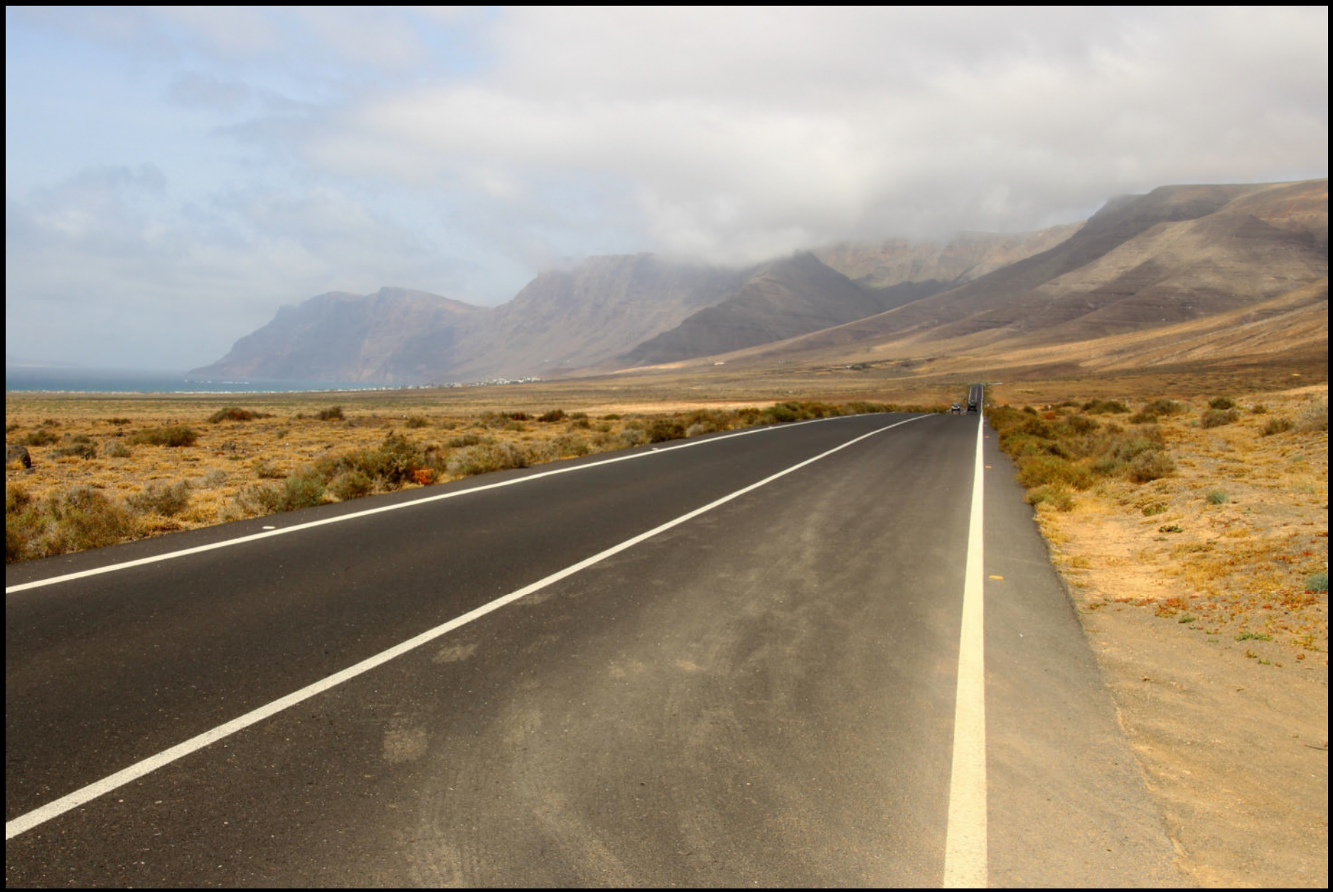
☺ Be aware - despite full throttle and determination - that the streets of life also have surprising curves. ☺ On the drive to the touristic-free surfer bay of Caleta de Famara a new road surface entice to an unnecessary stepping on the gas – May 2016